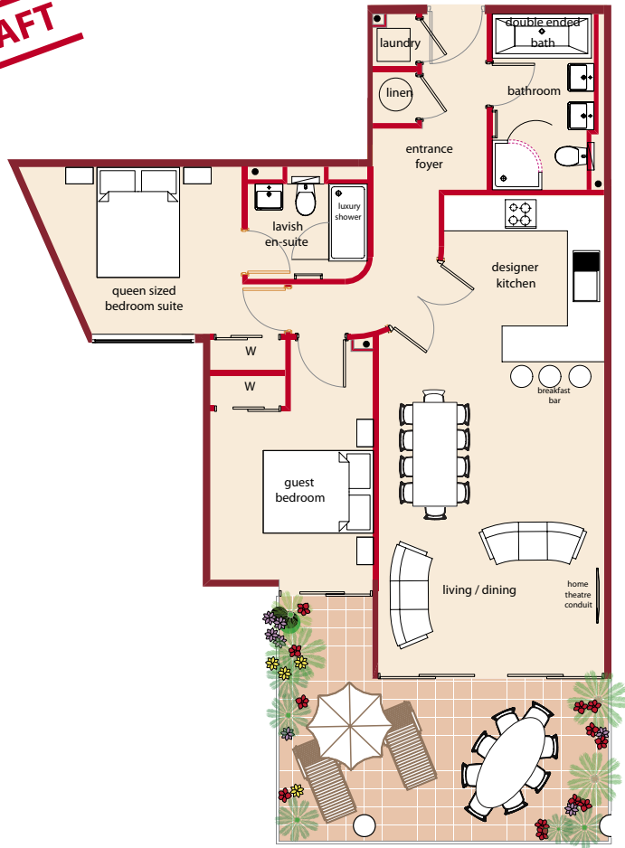
Gross Internal and Terrace 99m 2 (Internal 79m 2 • Sun Deck Terrace 20m 2 )