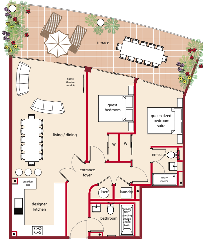
Gross Internal and Terrace 112m 2 (Internal 80m 2 • Sun Deck Terrace 32m 2 )